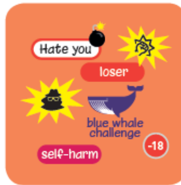
Exposure to harmful or disturbing content