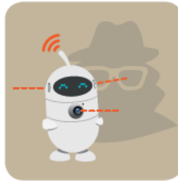
Privacy concern in connected toys