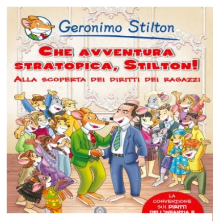
Resource 8: Italy

The Ombudsman for Children in Iceland reported on the long-awaited incorporation of the Convention on the Rights of the Child to their national law, advancing the rights of children within the country through implementing the four vital dimensions of the Convention,