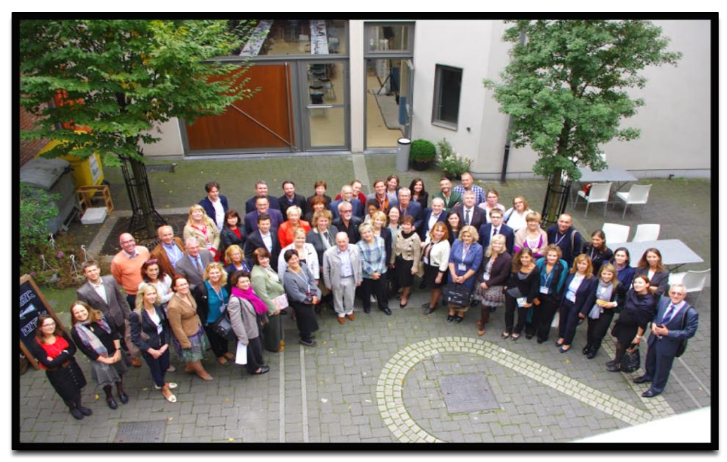
Resources 10 : ENOC Members