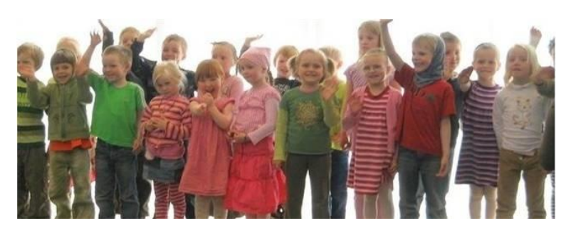
Resource 7: Iceland

In the second session of parallel workshops, promotion of children's rights, violence cases and child participation were examined. First, in <u>promoting children's rights</u>, Bosnia & Herzegovina pointed out the importance of strengthening bonds between Ombuds-institutions and civil society in terms of solid cooperation, followed by another display illustrating raising awareness of the Convention on the Rights of the Child in their country.