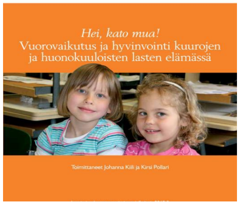
Resource 5: Finland

and families. The proposal formulated by the Ombudsman was that if parents have to become service providers when the State does not offer developed services for children with disabilities, it should be the State's responsibility to provide adequate financial support to those parents securing their children's existence. Northern Ireland's presentation focused on suicide and multiple adversities whereas Lithuania has carried out an investigation on children living in school dormitories to assure their rights are protected and their interests are taken into consideration. As a result of discovering that there are a number of violations of children's rights and failures to comply with safety requirements, the Ombudsperson for Children of Lithuania made a few vital recommendations to the Ministry of Education and Science, all municipalities and to all academic institutions. England further acknowledged predicaments where children are being excluded from school and has taken a deeper look at illegal exclusions and inequalities within the education system.