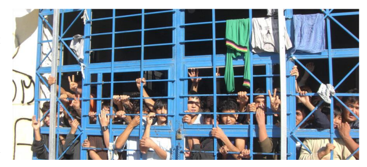
Resource 4: Greece

Children's Rights Ombudsman issued special reports making specific proposals addressed to responsible governmental bodies and as a result, many improvements have been made for unaccompanied children. However, challenges concerning family reunification, time of detention, age