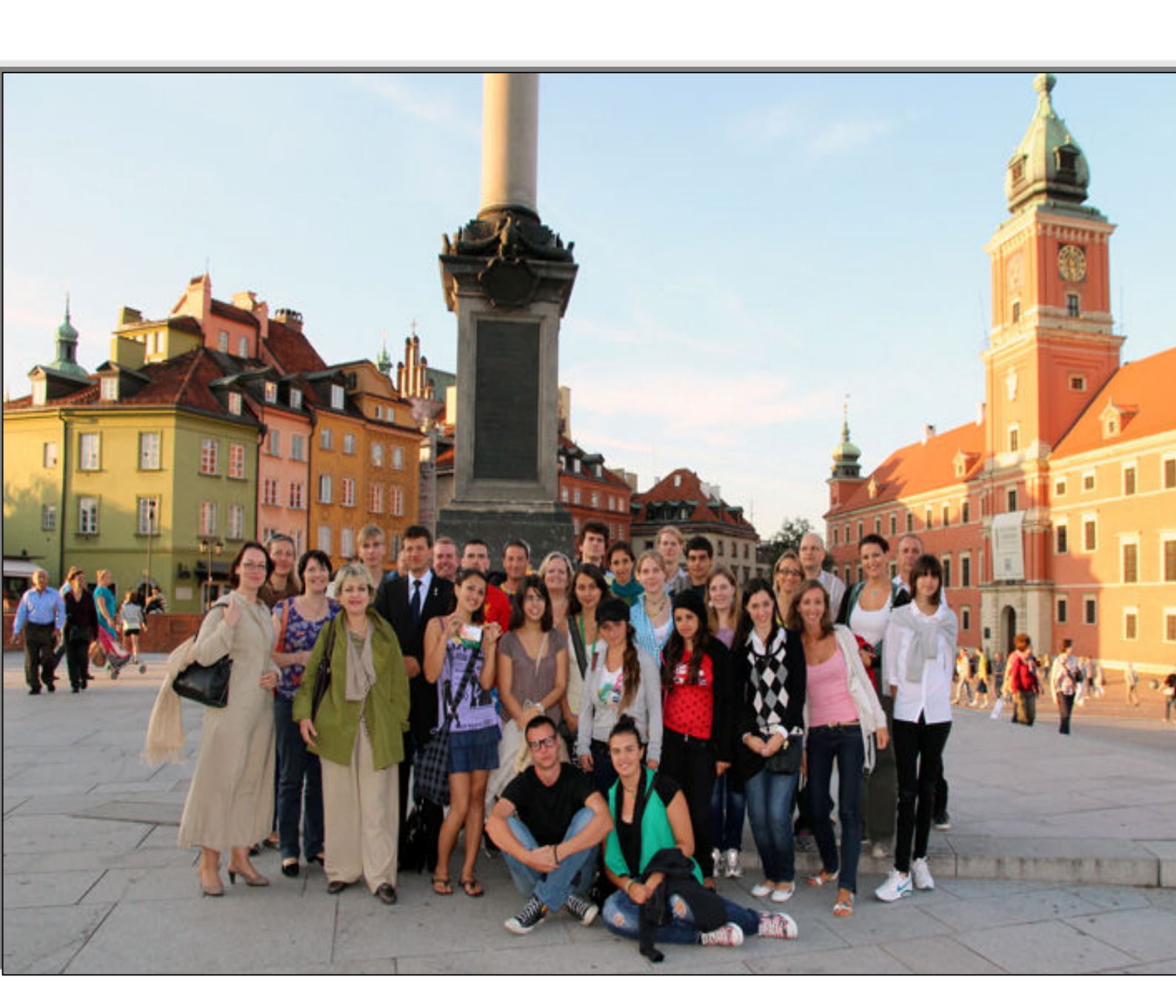
ENYA WARSAW meeting, August 2012 & ENOC Bureau