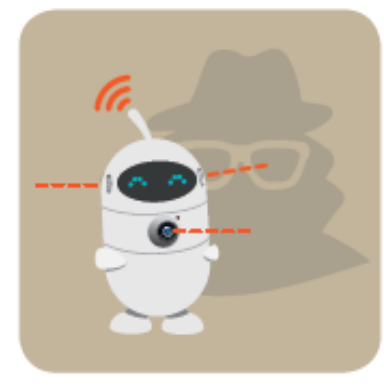
Privacy concern in connected toys