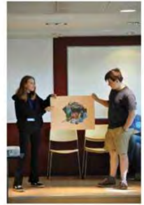
Belgium - Flanders