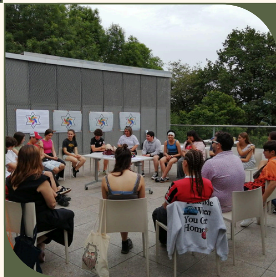
Croatia and Basque Country/Spain teams.

In addition to discussions and presentations, some participants carried out research and invited experts, such as representatives from ministries, public health institutes, local hospitals, nurses and medical students. In some cases, visits to hospitals were organised, allowing children to meet (in person) with healthcare professionals.